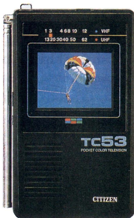
Figure 3: Hand-held TV with full colour LCD.

The truly portable computer became a reality because of the advent of personal computers in the late 1970s